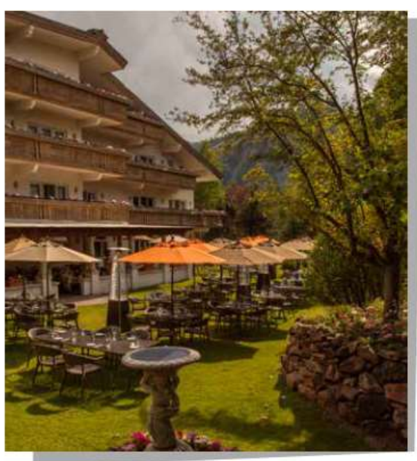
June 2016 | Boise Lifestyle 23

RIDE THE RAPIDS - This scenic outing on the Salmon River allows you to choose your own excursion with White Cloud Rafting Adventures. Your river adventure includes a two-night stay, a rafting trip adventure for two, transportation to/from White Cloud and a $100 dining credit for dinner for two at The Grill at Knob Hill.